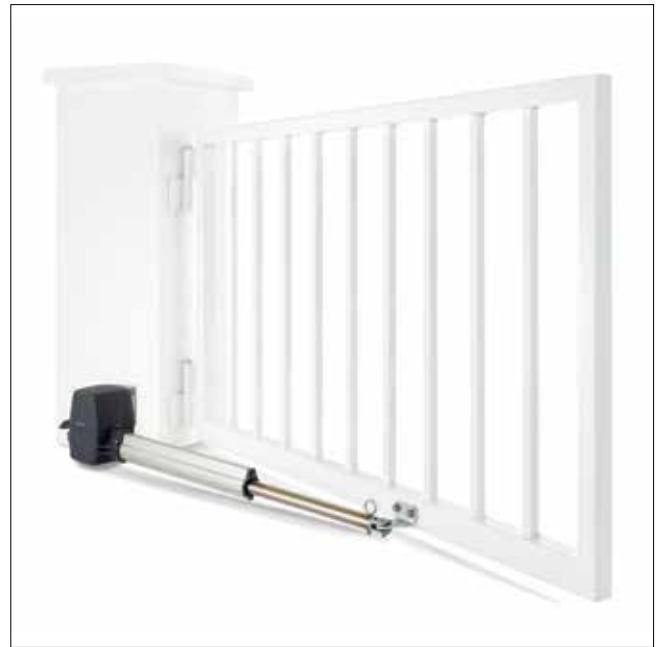
Entrance gate operators RotaMatic

GARAGE DOOR OPERATORS. The operator generation 4 now comes with even faster door opening and smart functions. The new LED lighting illuminates your garage evenly and makes getting in and out of the car easier. And thanks to the ProMatic Akku, you can enjoy all the benefits of an automatic operator in garages without a power connection.