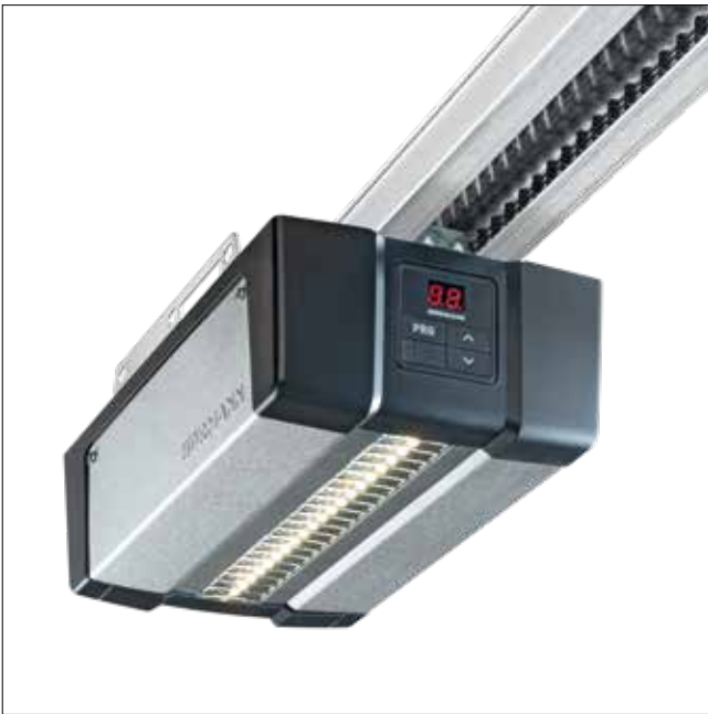
Garage door operators SupraMatic