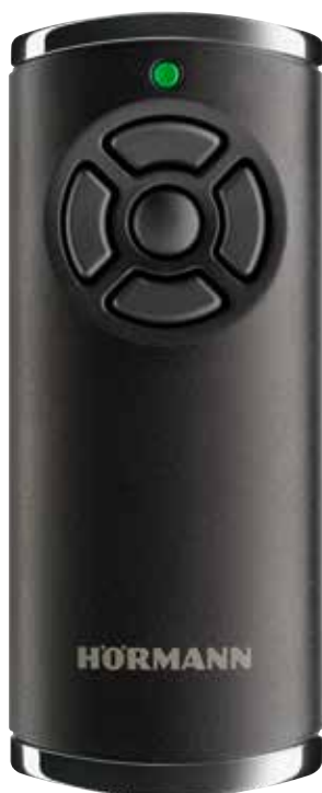
Figure on left: the green LED on the hand transmitter HS 5 BS indicates that your door is closed. The LED lights up red when the door is open. (Full-scale)

* An additional photocell is required for operation without visual contact to the door.